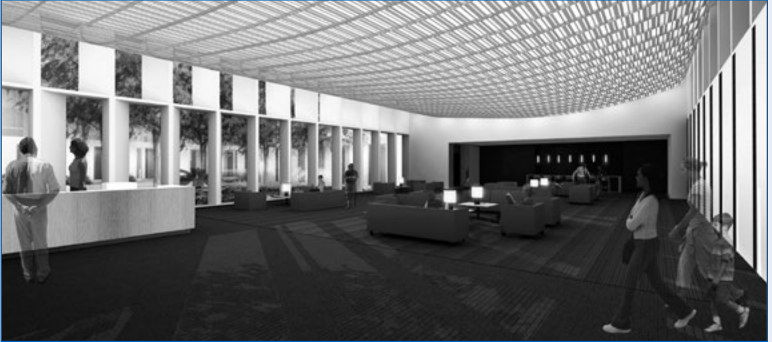
Lobby and reception area

For more detailed construction updates, please visit our website, www.templeisrael.com .