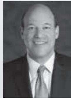
Ari Fleischer served as press secretary for President George W. Bush