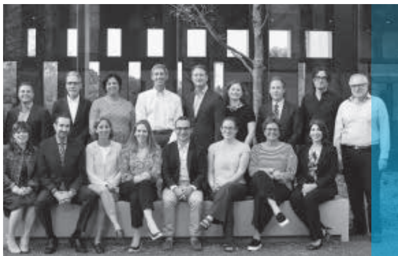
2017-2018 BOARD OF DIRECTORS