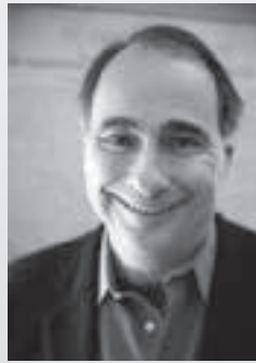
David Axelrod served as senior advisor to President Barack Obama

Jump into the arena of ideas! Two former White House staff members from different administrations will show us how to advance dialogue, even when we disagree.