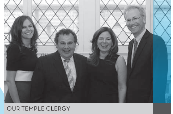
OUR TEMPLE CLERGY