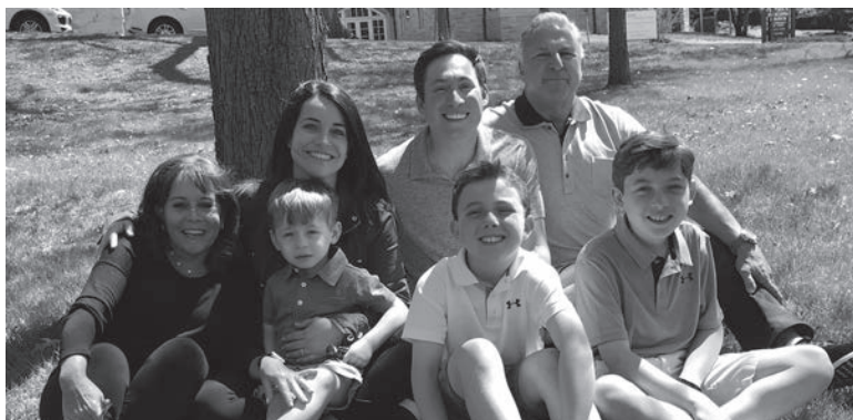
BROMS AND MALK FAMILY

Enjoy a summer afternoon at the lake with current, future, and alumni campers! All are welcome to the picnic and Erev Shabbat service.