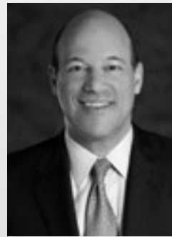
Ari Fleischer served as press secretary for President George W. Bush

SPONSORSHIP & TICKET INFORMATION www.templeisrael.com/benefit 612-374-0342 benefit@templeisrael.com