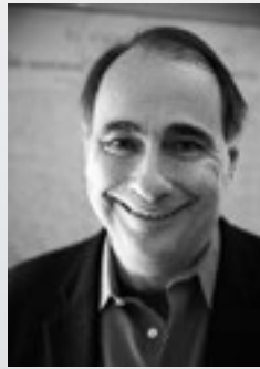
David Axelrod served as senior advisor to President Barack Obama

Jump into the arena of ideas! Two former White House staff members from different administrations will show us how to advance dialogue, even when we disagree.