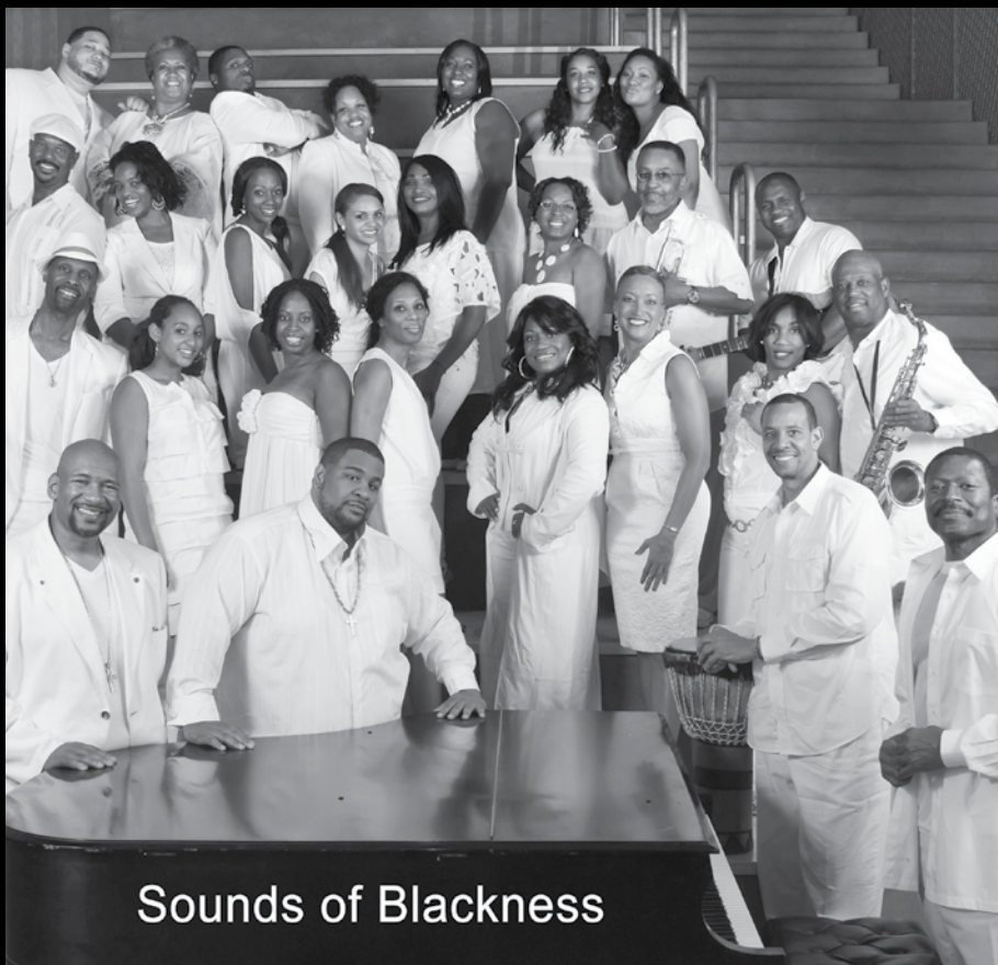
Sounds of Blackness

NON-PROFIT ORGANIZATION U.S. POSTAGE PAID Twin Cities, MN Permit #807