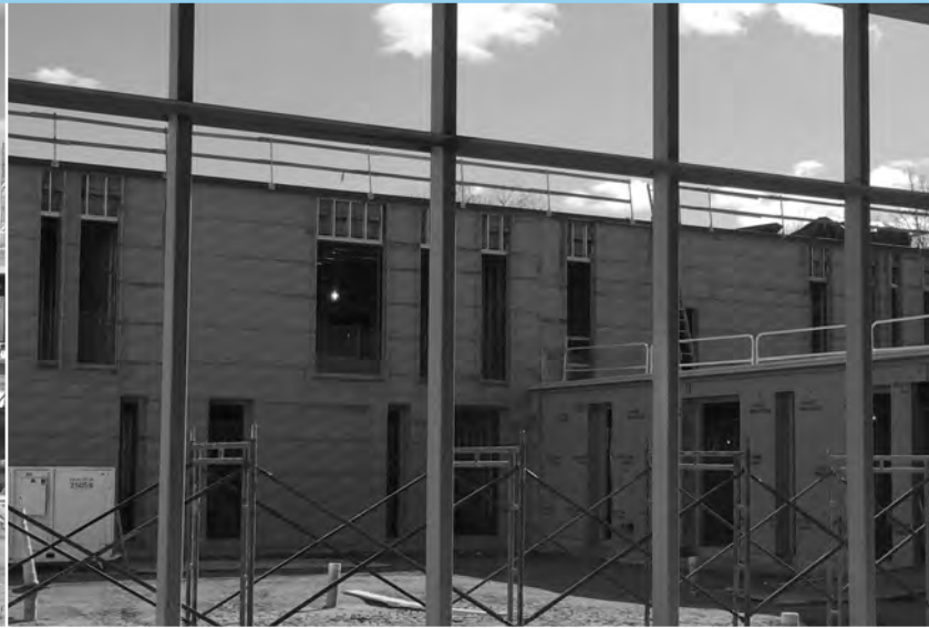
View from the lobby into the courtyard