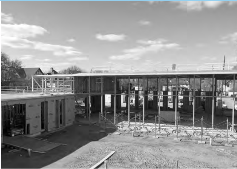
View of the courtyard from the new south Education wing