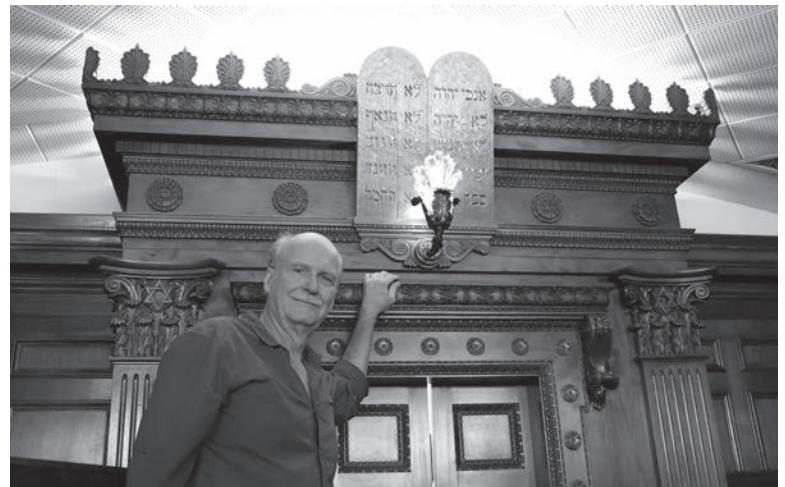
ARTIST CLAUDE RIEDEL